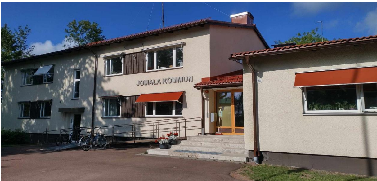
The municipal office found at Godbyvägen 448.

The municipality is responsible for various services to the residents. Below is a brief description of the services Jomala municipality provides for its residents. There is also a lot of up-to-date information on the municipality's website, which can be found on www.jomala.ax . The website can be translated by clicking the "translate" button in the upper right corner of the website.